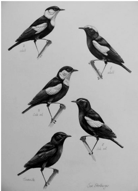
Fig. 1 Plumage stages of Myrmecocichla collaris : top left adult female, top right adult male, centre left sub-adult female, centre right sub-adult male, bottom left juvenile bird (identical for both sexes). Painting by Susan Stolberger

Two years later, Reichenow (1882) described Myrmecocichla nigra var. collaris (he considered M. nigra and M. arnotii to be conspecific). Neunzig (1926) provides additional details and is thus the most complete description of the form collaris . Neunzig notes that this taxon differs from leucolaema by females having a complete white collar that stretches behind the white ear coverts further extending the white coloration of the chin and throat; both forms have white cheeks. The type locality for collaris is listed as Kakoma, and Neunzig (1926) assigned the holotype as: Museum für Naturkunde Berlin Cat No. 27329, female, which we were able to confirm still exists (Fig. 2). Neunzig further noted that, where white-collared birds were collected, female birds without the white collar were absent. In summary, we note that females of both the forms leucolaema and collaris have predominantly white cheeks but only collaris has a complete white collar. Males of the two forms appear to be identical, and do not differ in plumage from the nominate race arnotti . The type locality Kakoma is close to where we collected birds in Ruaha National Park, and the descriptions separating leucolaema from collaris appear to match our observations of plumage variation.