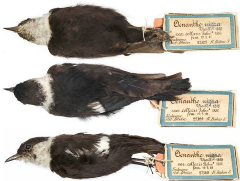
Fig. 2 Type of Myrmecocichla collaris housed in the Museum für Naturkunde, Berlin (Cat. No. 27329, adult female).

Since the publication of Neunzig's (1926) paper on Myrmecocichla nigra and arnotti , scattered observations and collections have been made of the white-collared form. Surprisingly, in all cases, the conjecture has been that white-cheeked/collared birds were aberrant specimens. For example, eight specimens in the British Museum of Natural History at Tring, were observed to have white cheeks [91.6.25.1.(19.1), 1934.10.19.-55 (19.1), 1909.12.31.167. (19.1), 1947.5.29 (19), 1945.34-210 (19), 1939.5.9-18 (20), 99.3.1.92 (20), 1931.12 0.21.64 (20)]. None of these specimens had complete white collars, and, interestingly, label dates indicate that they were probably sub-adult birds taken when full plumage characteristics of collaris would not have been complete. All eight specimens were collected in south-central Tanzania, northern Zambia, and the Albertine Rift, and therefore agree with our findings of this western variation. Other interesting examples are the collection of a white-collared bird from Kagera, in the Kivu Region (AMNH 582811) of the Albertine Rift, as well as a specimen collected more recently from Lwiro, Southern Kivu Province, Democratic Republic of the Congo (FMNH 438821).